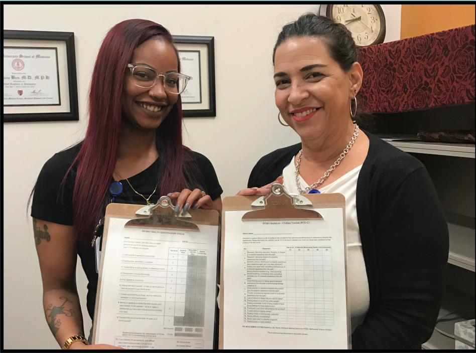
Staff members with the screening tools