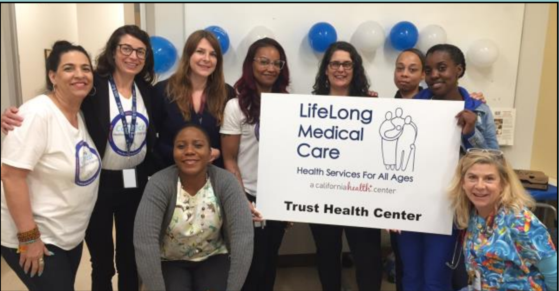
Clinic staff at the 7th Anniversary of the ACA Celebration